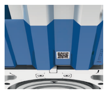
Unrivalled stability: the DIENES honeycomb structure

DIENES is setting new standards for narrow cutting widths with the DS 4 knife holder. The knife holder is intuitive to operate and impresses with its low-vibration design and exceptional stability – even for cutting widths from 19 mm and speeds of up to 1,200 m/min.